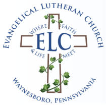
TABLE TALK October 2022