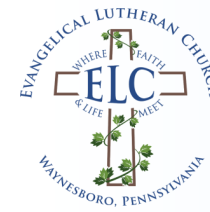
TABLE TALK February 2021

To worship God the Father, Son, and Holy Spirit in a meaningful and inspirational way; to proclaim the good news of God's love through Christ; to minister to those whose lives we touch in the church, in the community, and in the world; to teach and train our members to be more effective disciples for Christ; to help our members to discover, develop, and use their individual spiritual gifts; to seek out people in the community who do not know Jesus, to encourage them to become his disciples, and then to help them become responsible church members; and to build an atmosphere of Christian love.